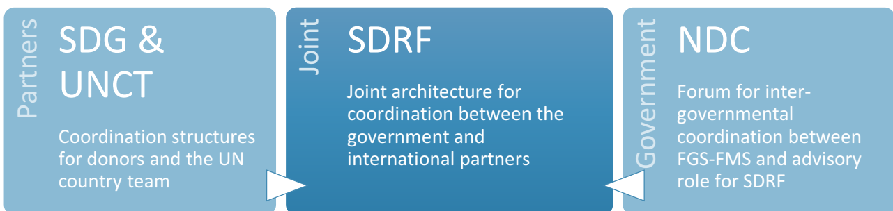
Figure 1. SDRF: Centerpiece for Partnership between Government and International Community

In addition to the coordination role it plays for all development resources, the SDRF provides a common governance structure for three multi-partner trust funds administered by the African Development Bank, the United Nations and the World Bank. The SDRF functions for these funds and associated procedures are detailed in the “Operations Manual for SDRF Funding Windows.” 2